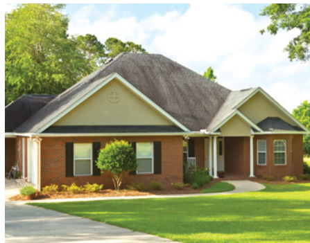
Gable ends are the easiest to strengthen and respond to pressure within the house by bowing in and out.

Window Protection. Shutters can be seen, so most people think of them as the first method of protecting a home against high winds and disaster damage. However, shutters are only one of many recommended mitigation activities. Generally, mitigation features that cannot be seen make the biggest difference. For example, a continuous load path and roofing protections are the key components of protecting the structural integrity of homes.