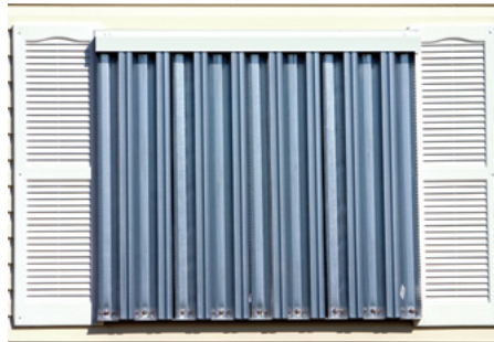
Shutters protect homes against high winds and disaster damage and are just one of many recommended mitigation activities.

Florida's Division of Emergency Management (FDEM) has guidance available about mitigation treatments. Many of these mitigation treatments prevent or lessen damage caused by high winds that occur with storms. Wind causes damage by entering the home through poorly sealed openings. Wind damages homes by increasing pressure and causing uplift forces on the roof.