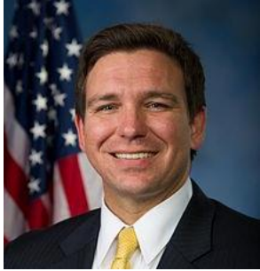
Governor Ron DeSantis GovernorRon.DeSantis@eog.myflorida.com