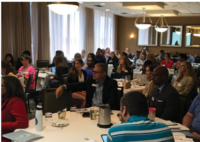
Senior staff from CoCs across the state participate in a DEO sponsored workshop in May, 2019.