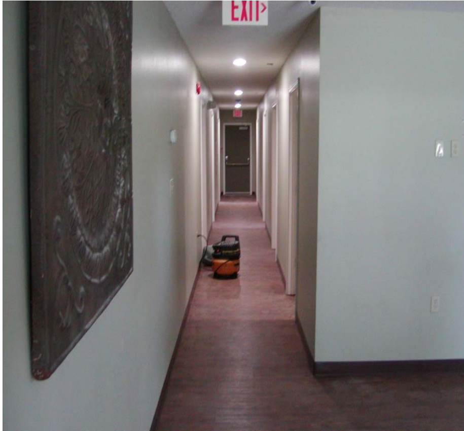
New Vinyl Plank Flooring