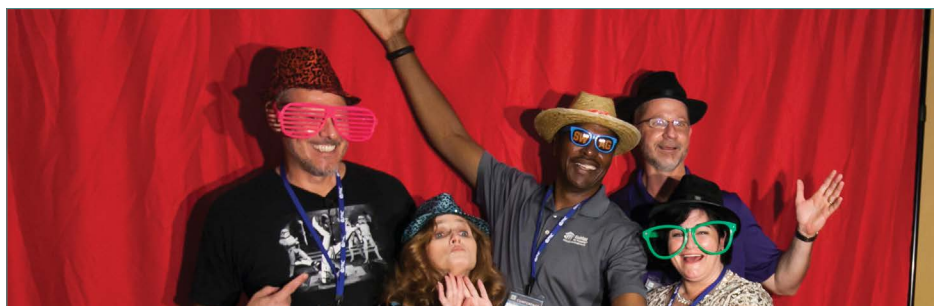
This Year's Photo Booth is Sponsored by Related Urban Group

Gather to enjoy friends, colleagues, food, beverages, and music. The reception is an opportunity to have fun and network with conference participants and presenters.