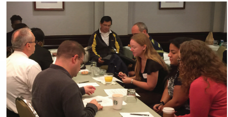
PARTICIPANTS USED THE STATUTORY DEFINITION LISTED BELOW AS THEY IDENTIFIED APPLICANTS WHO ARE (AND ARE NOT) SPECIAL NEEDS.

"An elderly applicant is in good health, mobile, capable of driving and living on her own at 68 without any independent living supports—Is she a Special Needs applicant?"