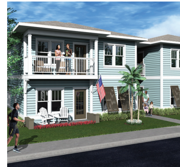
BOLEY DUVAL PARK