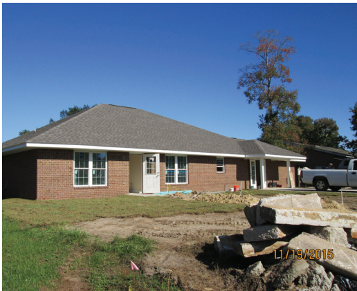
ESCAMBIA COUNTY AND THE CITY OF PENSACOLA ARE HELPING TO FINANCE THE NEW CONSTRUCTION OF A GROUP HOME IN PARTNERSHIP WITH THE ARC GATEWAY

Although some SHIP offices comply with the set-aside using their primary strategies, other have adopted separate strategies targeted to special needs populations. Some strategies are designed to repair or construct group homes for individuals with developmental disabilities, wounded veterans, youth formerly in foster care, or other special needs groups.