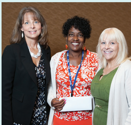
PNC Raffle Winner: The East Tampa Business & Civic Association

The East Tampa Business and Civic Association won the PNC raffle, while the Wells Fargo prize went to the Arcadia Housing Authority.