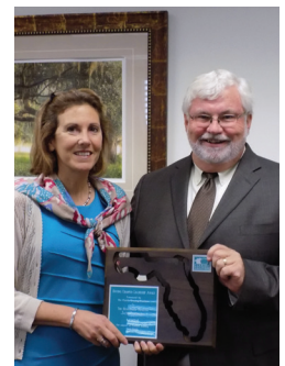
Sen. Jack Latvala