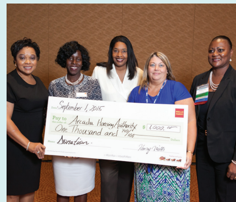
Wells Fargo Raffle Winner: The Arcadia Housing Authority