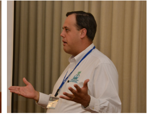
Florida Nonprofit Housing Advocates Network Caucus