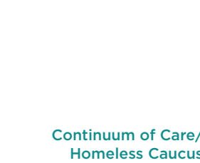
Continuum of Care/ Homeless Caucus