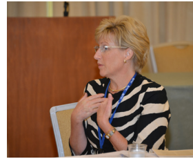
Bipartisan Policy Center Housing Commission Caucus