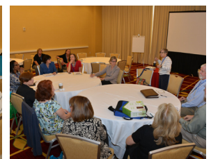
Utility Companies and Green Partners Caucus