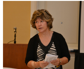
Habitat for Humanity Caucus