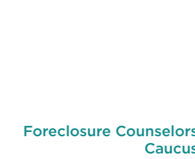
Foreclosure Counselors Caucus