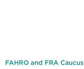
FAHRO and FRA Caucus