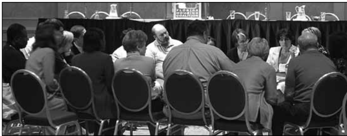
An impromptu meeting of conference attendees, sharing ideas about community land trusts.