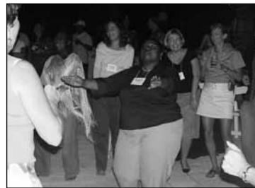
A good time was had by all at the conference reception.