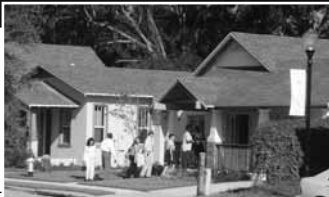
Success Stories and Tours.