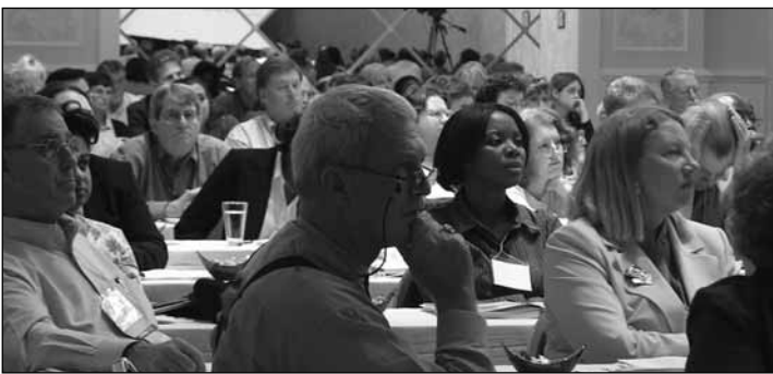
More than 600 housing professionals and advocates attended the Florida Housing Coalition's 2005 statewide annual conference.