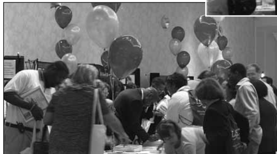
The Expo was a big success from the standpoint of the exhibitors who enjoyed the interaction with conference attendees, and the attendees who made personal connections with exhibitors, and sometimes won a boatload of prizes.