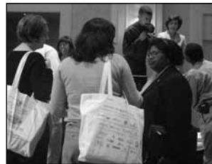
Networking is an important and fun time at every conference.