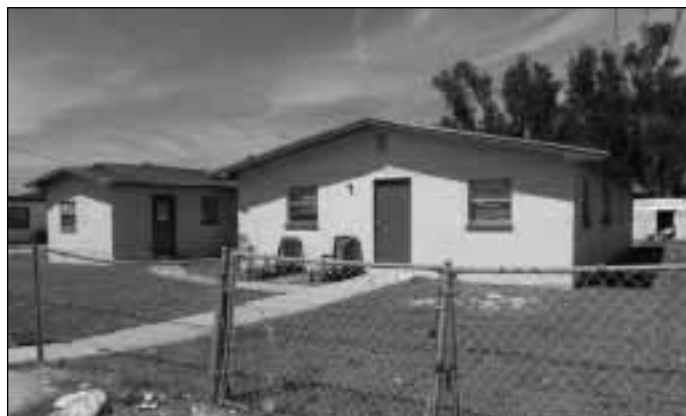
Existing apartment building where youth are currently living.

Established in 1902 as a Jacksonville orphanage, CHS is a statewide multi-service agency providing social services such as foster care, adoption, child abuse prevention, emergency shelters, group homes, case management and treatment for developmentally disabled children. There are two CHS projects associated with the Foster Youth Demonstration Loan: