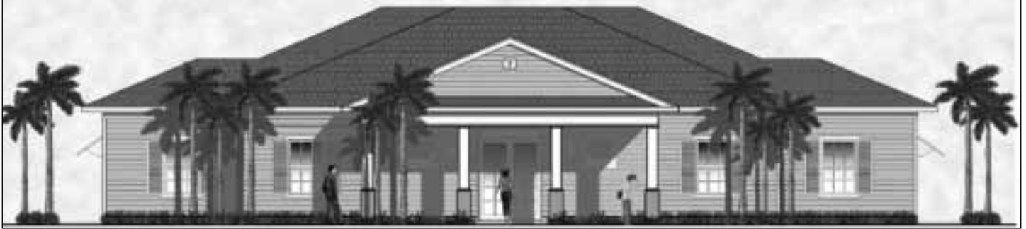
The New CHS Group Home- Vero Beach.

Project: CHS Treasure Coast Division - Transitional Living Program provides housing and aftercare services promoting independence and preventing homelessness. Its current 12 bed program will be expanded to include 9 newly constructed units, consisting of 6 - one bedroom and 3 - two bedrooms, 2 of which will be provided for parenting youth and one for a case manager. The program is designed for youth aging out of foster care and continuing their academic pursuits through a GED program, college, technical schools, and/or those being discharged from residential care such as mental health centers and/or juvenile justice placements.