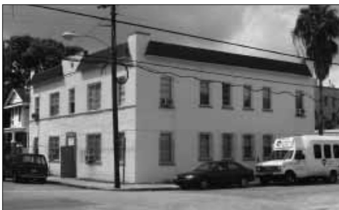
Camillus House, Lummus Park Historic District- Downtown Miami

Project: St. Jude will provide transitional housing for males out of foster care who are pursuing continuing education. Construction rehabilitation of an existing historic apartment building will provide eight – one bedroom/one bath units. Each unit will be fully renovated, furnished, and equipped with computers. The project is within walking distance to the Miami Dade Community College Downtown Campus and public transportation. A case manager will live