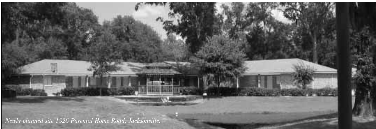
Newly planned site 1526 Parental Home Road, Jacksonville.